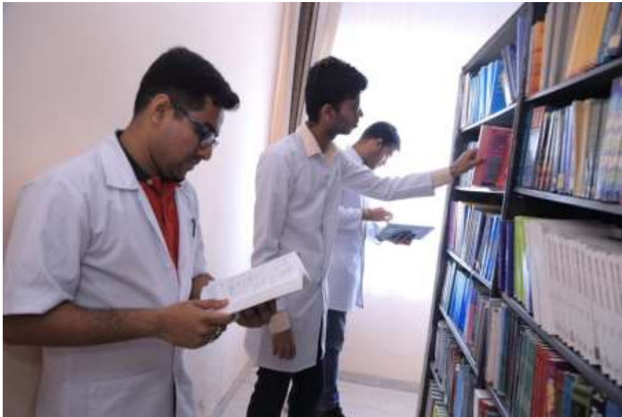
Kyrgyz State Medical Academy Library