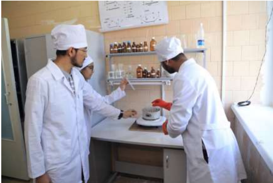
Kyrgyz State Medical Academy Lab