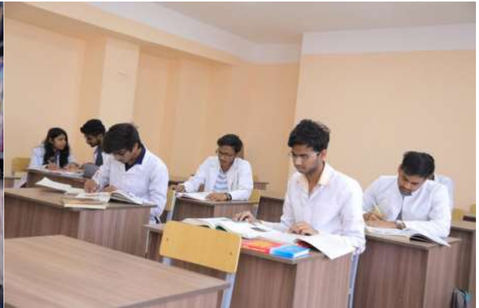
Kyrgyz State Medical Academy class room