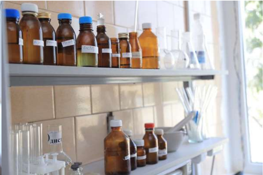
Kyrgyz State Medical Academy Lab