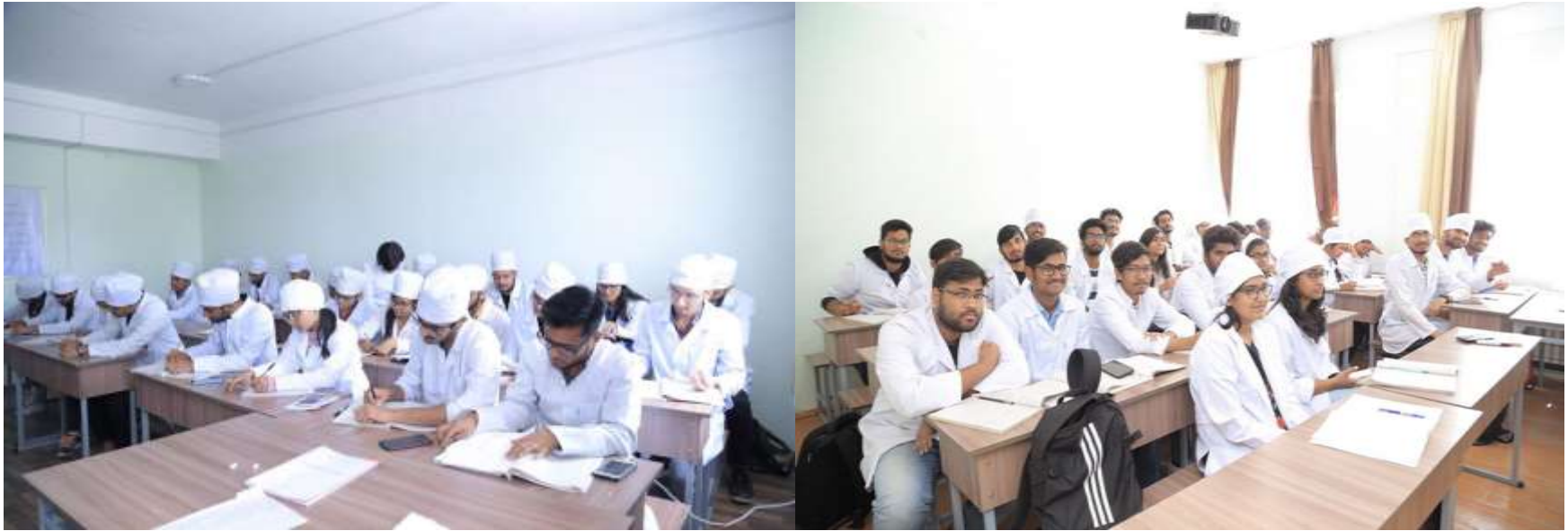
Indian students at at Kyrgyz State Medical Academy