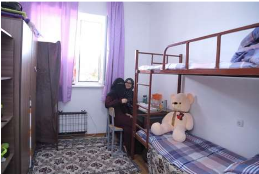
Girls hotel room at Kyrgyz State Medical Academy.