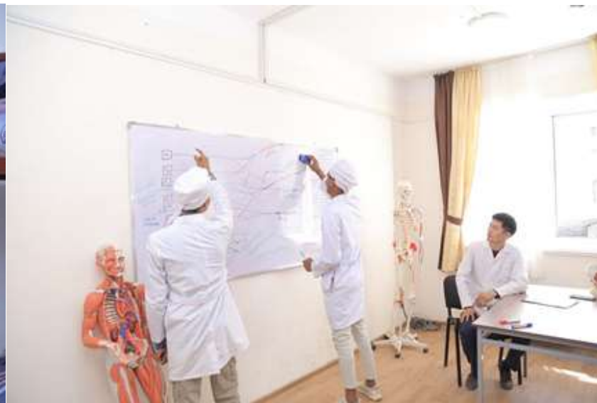
Kyrgyz State Medical Academy Class