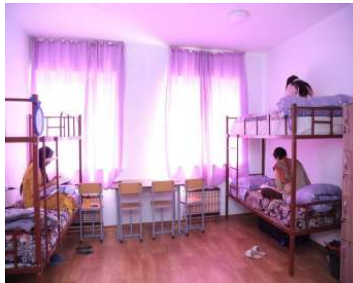
Kyrgyz State Medical Academy hostel room